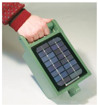
Easy, Small and Accurate

The Apollo is now equipped to handle the new CitiTube™ and short road tube spacings. CitiTube is a new product which combines two road tube inputs into a low profile one-piece solution, allowing a measure-free and simplified setup on site.